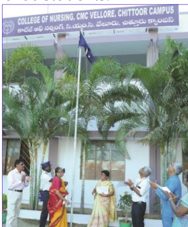
Dedication of Chittoor Nursing College

Breaking News: The College of Nursing, CMC Vellore Chittoor Campus, has just admitted its first batch of 50 students.