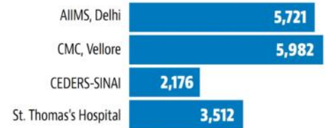
CHART 1 Outpatients per day

A study compared two Indian hospitals with hospitals in the US and UK. The Indian hospitals saw more patients at a fraction of the cost of the other two.