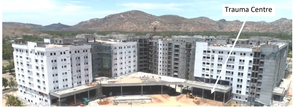
Kannigapuram hospital nearing completion

2020 marks 120 years since CMC's founder, Ida Scudder, started her work in Vellore. We still respond to urgent medical needs today. Our new Kannigapuram hospital, 10 km from CMC, opens mid-2020. It will address issues of the modern age – especially trauma. Road accidents are the leading cause of death for people aged 5-29 years. Around 1,50,000 people die on India's roads each year and three times as many suffer long-term disabilities. CMC's Trauma Care Centre will save victims' lives, reduce disabilities and rehabilitate survivors.