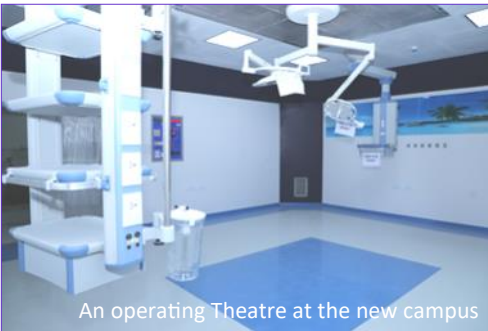
An operating Theatre at the new campus

On 17th October we marked World Trauma Day with an awareness march. Staff, doctors and students walked from the Vellore Fort to CMC hospital carrying banners and shouting slogans. Throughout the day there were stalls showing first aid techniques and safety tips. A motorbike simulator tested peoples' driving skills. The blood bank donor bus was parked there, allowing people to donate blood on the day.