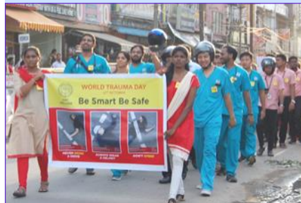
Helmet awareness walk

Ideally located on the busy NH 48 between Chennai and Bengaluru, the new trauma centre will have 140 beds (including High Dependency and ICU) 7 state-of-the-art operating theatres, and a dedicated CT Scanner, ultrasound and x-ray. The specialist doctors and support teams will give multi-disciplinary care under one roof. It will be a pioneering, Level 1, trauma centre.