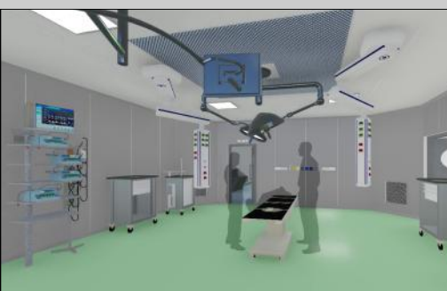
Left: architect's impression of an operating theatre in the new Trauma centre

We are creating a state of the art Trauma Centre . Ideally placed, on the Bangalore-Chennai highway, this is a much needed response to the plight of accident victims within a 50km radius. If you can contribute to the cost of equipping the trauma centre, or can help us meet the treatment costs of disadvantaged accident victims, please contact the Development Office.