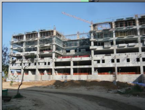
Above: Construction underway