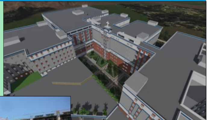
Above: Architects impression of hospital

Phase 1 focuses on non-infectious diseases such as cancer and heart problems. But eventually all specialities will be made available there.