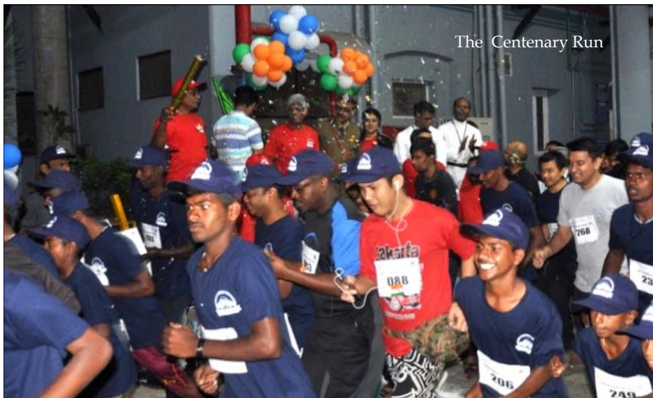
The Centenary Run

To order your copy, write to the Development Office, CMC Vellore. The book costs Rs. 3000 plus 100 for packing and postage within India.